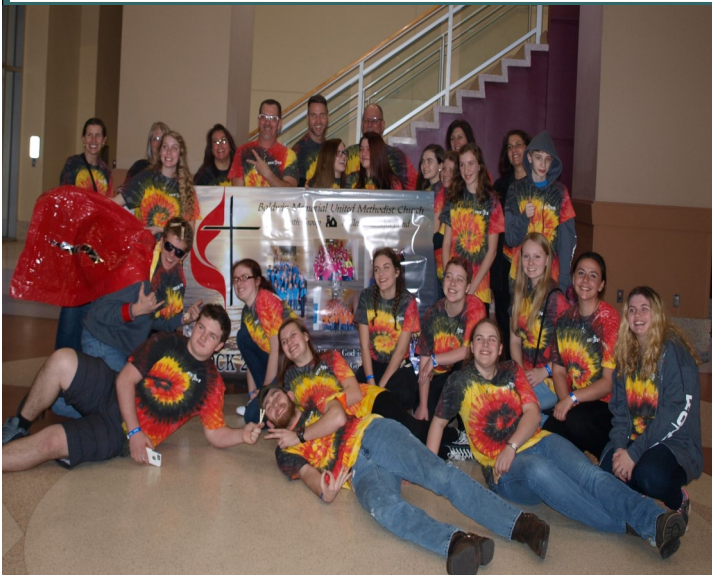
BMUMC sent 28 youth and adults to ROCK 2018 . Many thanks for your continued support of our UMYF