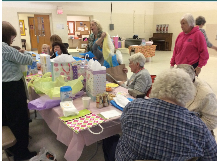
Baby shower for Mary's Cradle

Last year was our first year selling Valentine's Day wreaths, candies, jewelry, scarves, sneakers etc. Congregation members enjoyed our sales so much they requested another sale. Watch for further information as Valentine's Day approaches. We hope to offer more surprises.